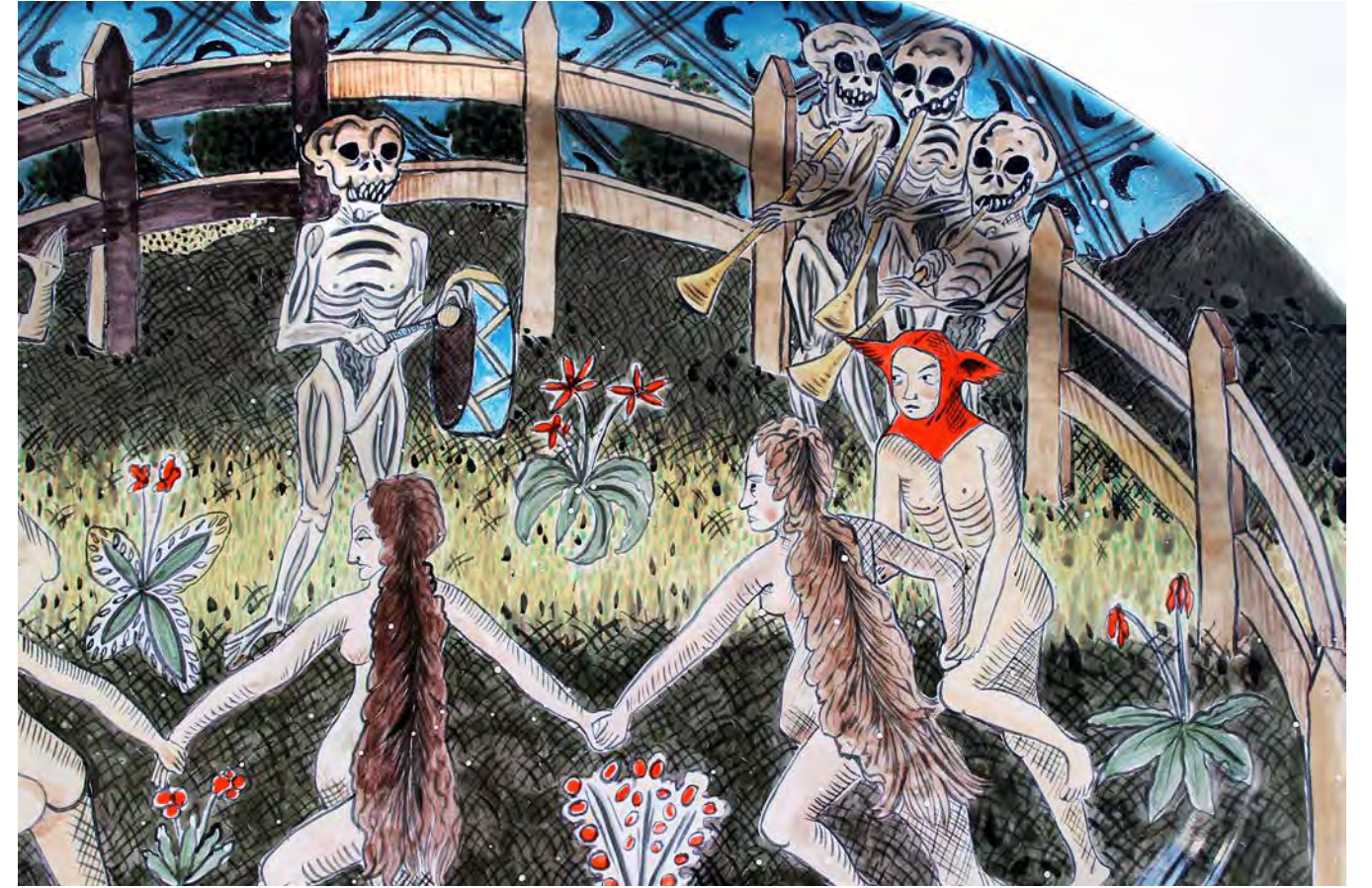
Lindsay Montgomery, "The Dance Charger", 2015, tin-glazed, press-molded earthenware, painted, 25 x 11 inches (above with detail, opposite)