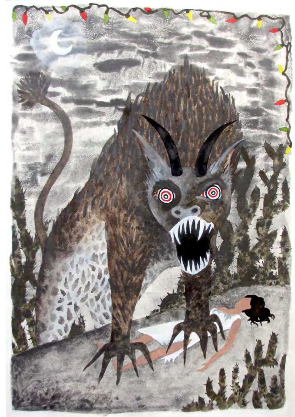
Keri Oldham, "Texas Chupacabra", 2018, watercolor on paper, 21 x 18 inches