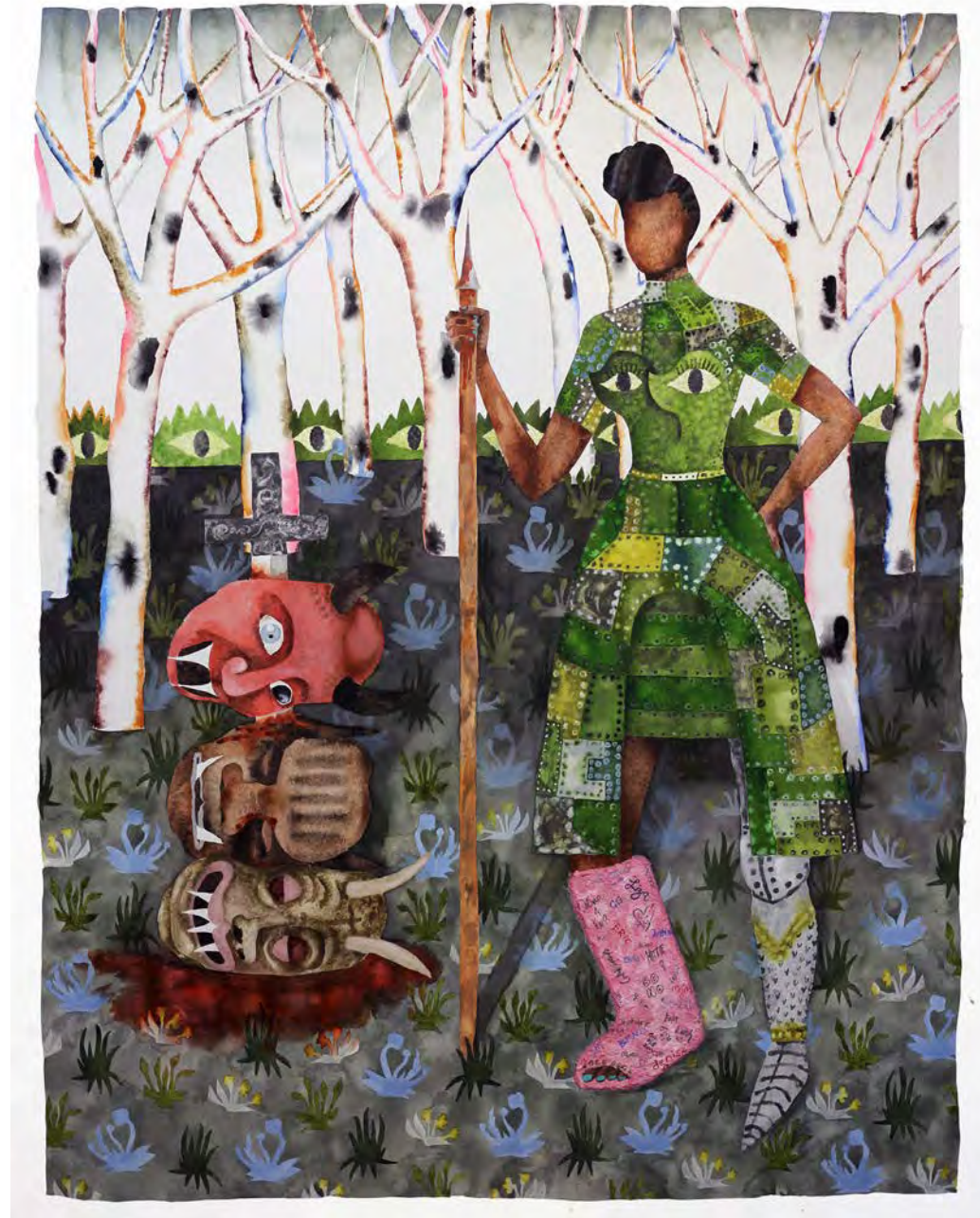
Keri Oldham, "Evil Eye Warrior", 2016, watercolor, graphite, paper pulp on paper, 62 x 50 inches, (above, with detail opposite)