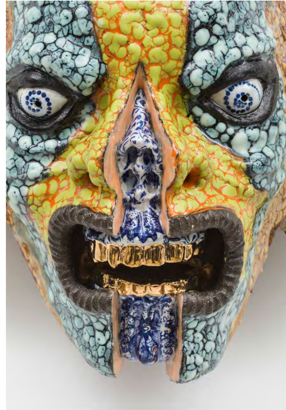
Roxanne Jackson, "Kraak Fiend," 2019, black clay, glaze, luster, 11.5 x 14.5 x 8 inches, (opposite, with detail above)