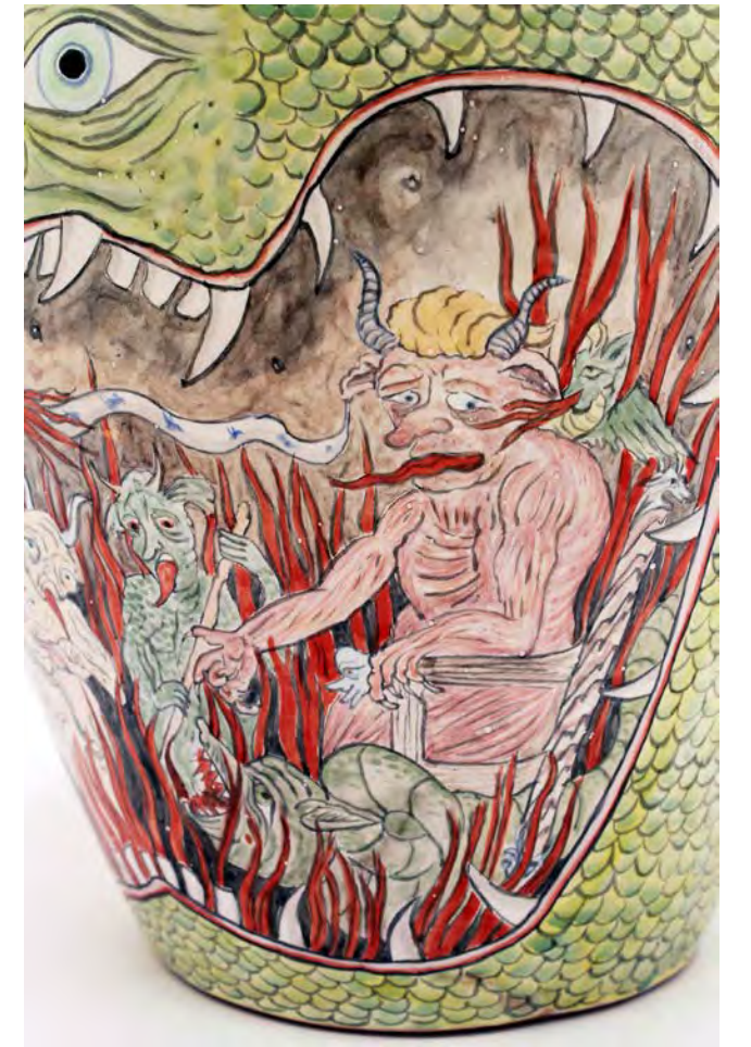
Lindsay Montgomery, "The Kingdom", 2020, tin-glazed earthenware, 17 x 9 inches (opposite, with details above)