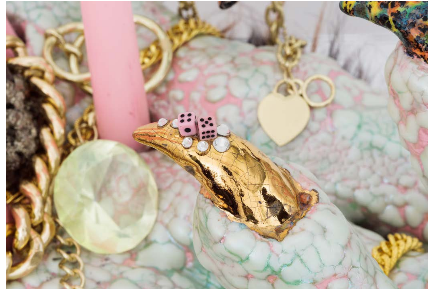
Roxanne Jackson, "Lesser Evil", 2018, ceramic, glaze, luster, faux fur, chains, minerals, candles, 15 x 8.5 inches, (opposite, with detail above)