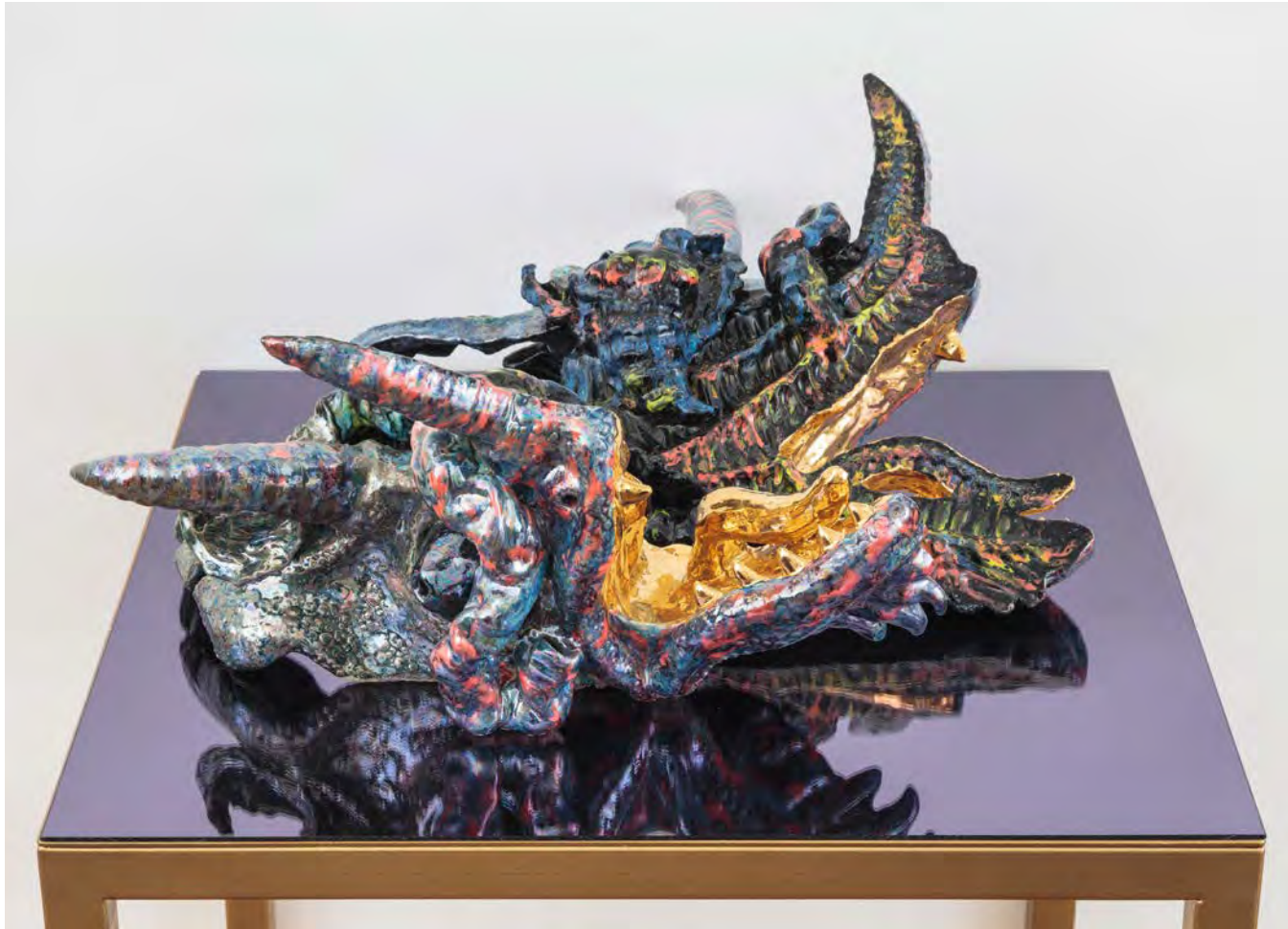
Roxanne Jackson, "Karma Chamillionaire", 2018, ceramic, glaze, luster, 22 x 10 x 24 inches, (above, with detail opposite)