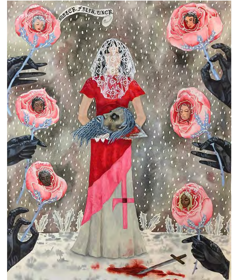
Keri Oldham, "Mother, Daughter, Wife", 2018, watercolor on paper, 32 x 24 inches

The women in Oldham's paintings are not nice. They unapologetically use their bodies for gain and slay monsters that need slaying. They challenge male and female roles. To build this narrative, Oldham