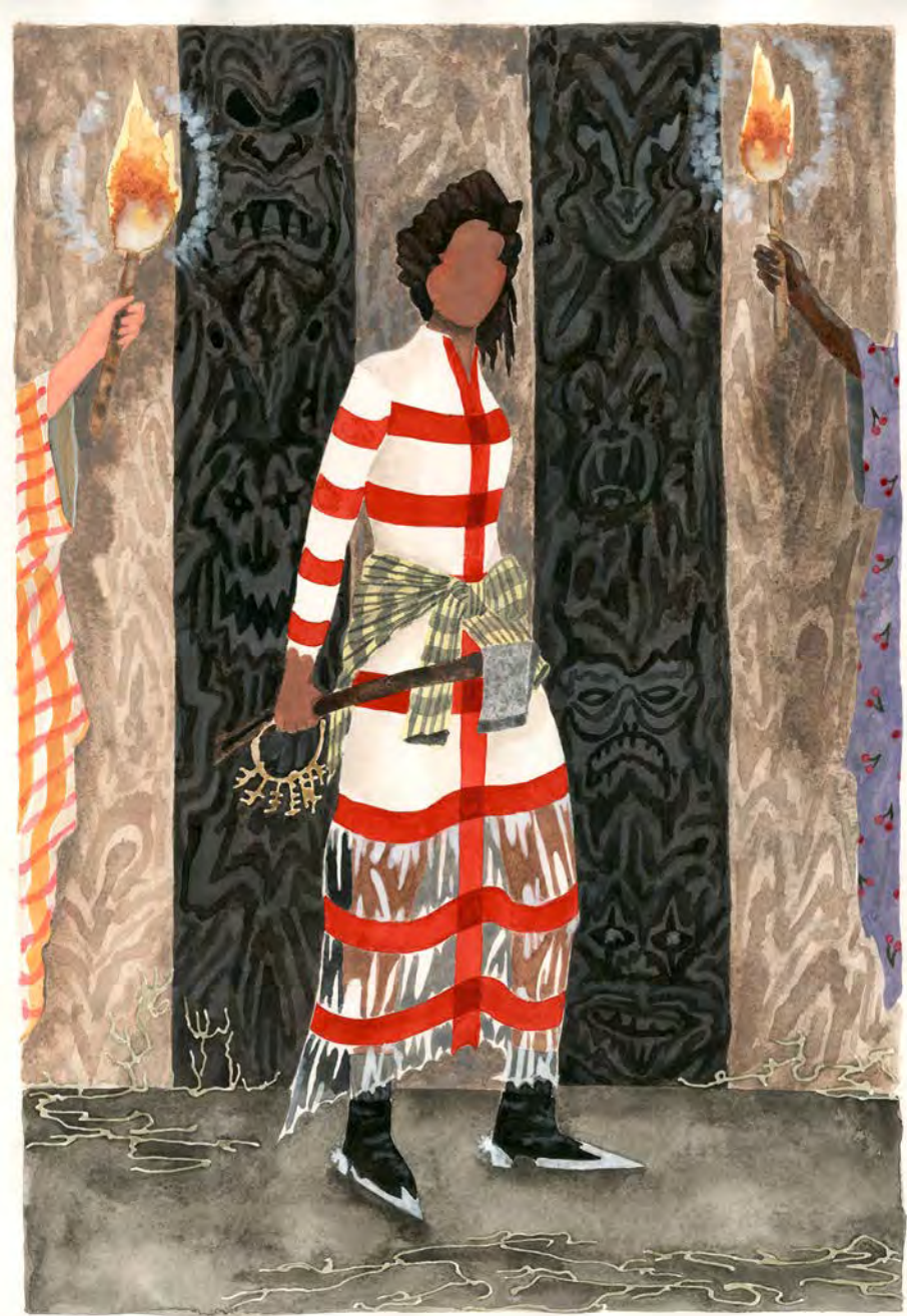
Keri Oldham, "Night Raider", 2018, watercolor on paper, 21 x 16 inches