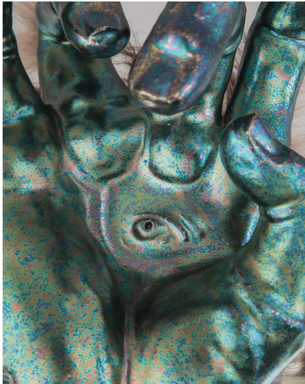
Roxanne Jackson, "Beastmaster", 2019, ceramic, faux fur, glaze, rhinestones, candle, 15 x 19 x 11 inches, (opposite, with detail above)