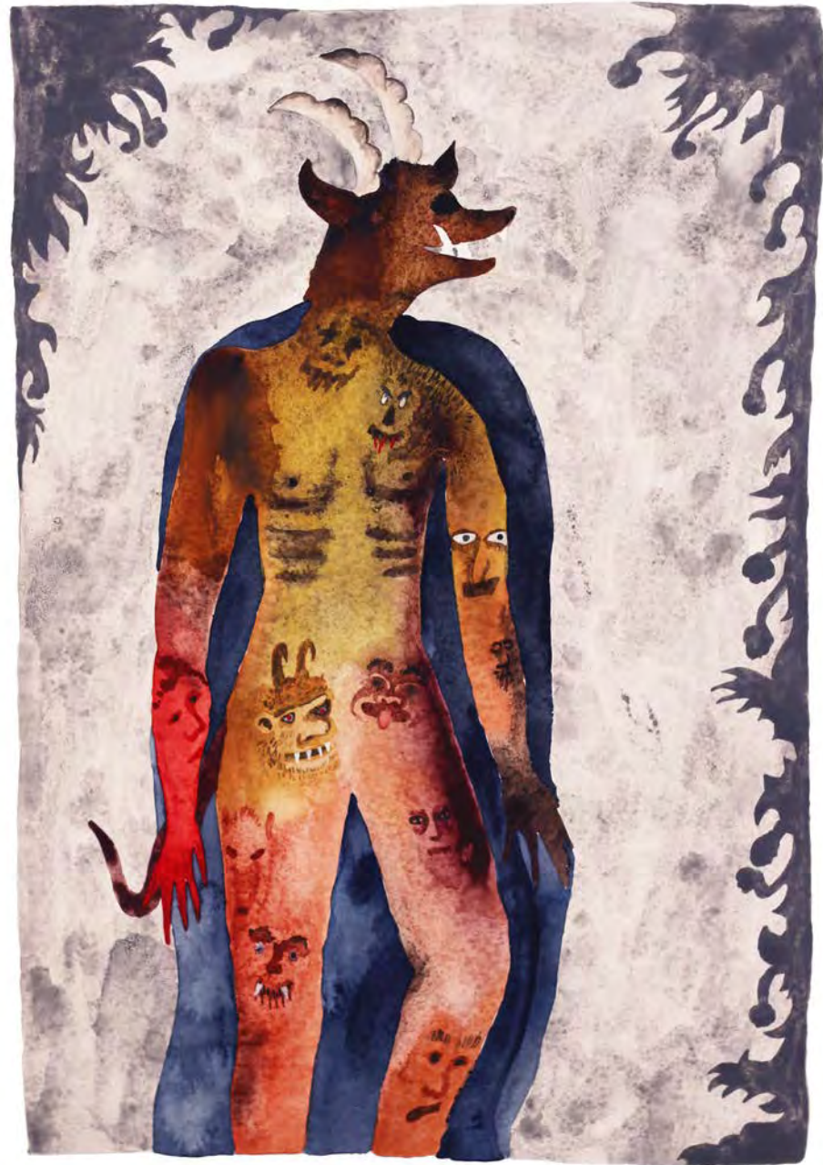
Keri Oldham, "Demon Hyena", 2016, watercolor on paper, 22 x 15 inches