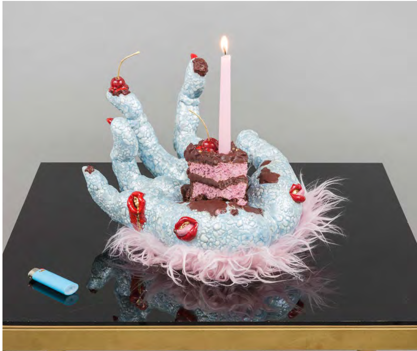
Roxanne Jackson, "Sweet Tooth", 2019, ceramic, glaze, gold leaf, candle, luster, faux fur, 15 x 12 x 11 inches, (above, with detail opposite)