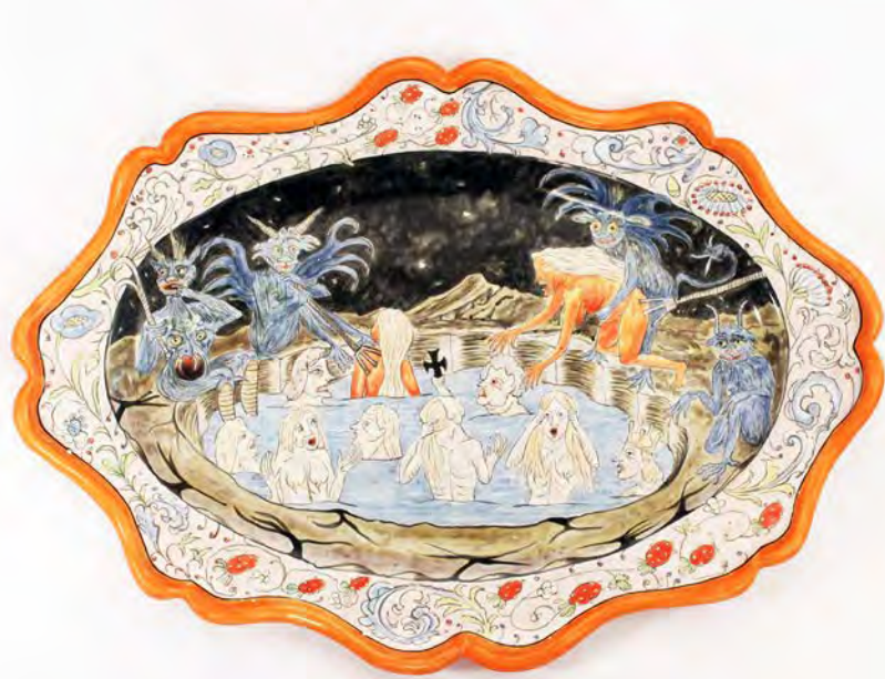
Lindsay Montgomery, "Karens", 2020, tin-glazed earthenware, 18.5 x 13.5 x 1.5 inches (with detail)

Take "The Dance" (2015), a decorative serving plate, neutral in tone, that pictures naked women dancing in a circle while a skeleton beats his drum. The image resembles a fragment of Fra Angelico's 'The Last Judgment' and the carola of the saints, (1425-1430), a panel inspired by biblical verses that picture the separation of the blessed and the damned, sent into eternal life or infernal punishment. In the relevant fragment to Montgomery's piece, Angelico renders the good women dancing in the grass, waiting for an angel to bestow everlasting life. But if this is a riff on the Last Judgement, Montgomery's version complicates the narrative. In her piece, she creates a Danse Macabre-like scene—a dance conceived during the plague to represent the inevitability of death. The historical reference feels timely to the Coronavirus pandemic, though the pagan allusions to nature, life, and rebirth offer a slightly more uplifting vision of the world. Montgomery renders several pregnant women, along with an androgynous figure dressed in an animal costume. Three other skeletons play hunting horns.