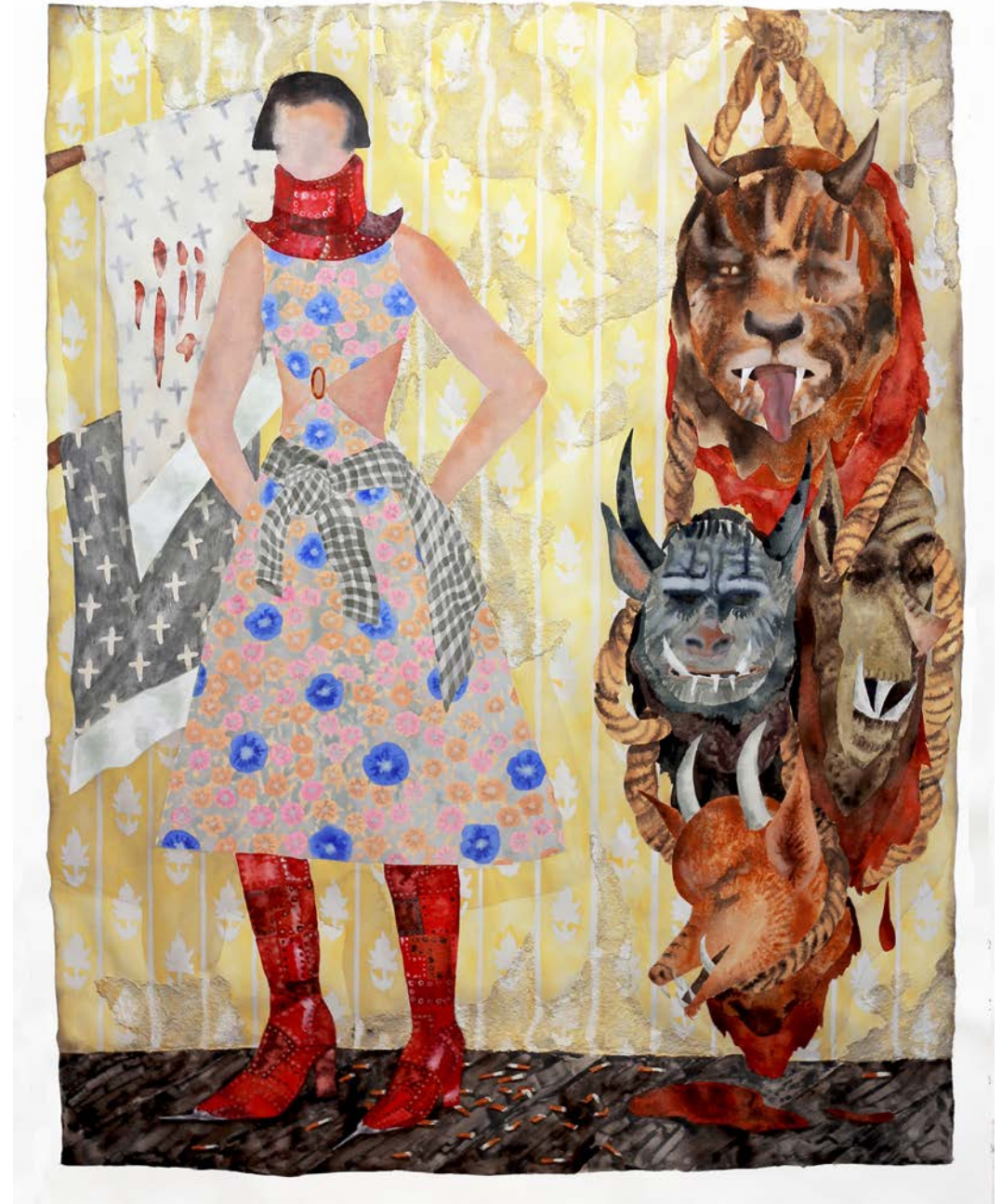
Keri Oldham, "Yellow Wallpaper", 2016, watercolor, graphite, paper pulp on paper, 62 x 50 inches