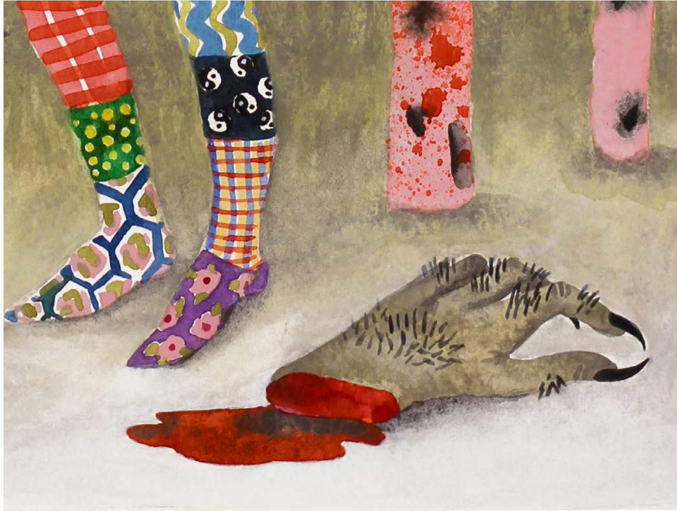
Keri Oldham, 2018, "Warrior with Severed Claw", watercolor on paper, 21 x 16 inches (opposite, with detail above)