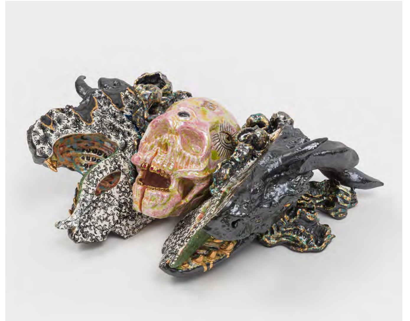
Roxanne Jackson , "Black Flame" , 2019, ceramic, glaze, gold leaf, 23.5 x 9 x 17.5 inches (above, with detail opposite)