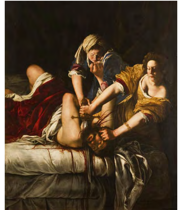
Artemisia Gentileschi, "Judith Slaying Holofernes", 1620, oil on canvas, 39.25 x 64 inches, Uffizi Gallery, Florence, Italy

The painted aesthetic of Lindsay Montgomery's plates and vessels draws from artworks made during the middle ages and renaissance, a time when the seeds of misogyny took root. The subjects, though, come from the 21st-century news cycle. Authoritarians and sycophants manifest as devils, each illustrating an unsafe cultural environment for women and minorities. At times, the images drawn from as far back as the 15th century feel almost predictive.