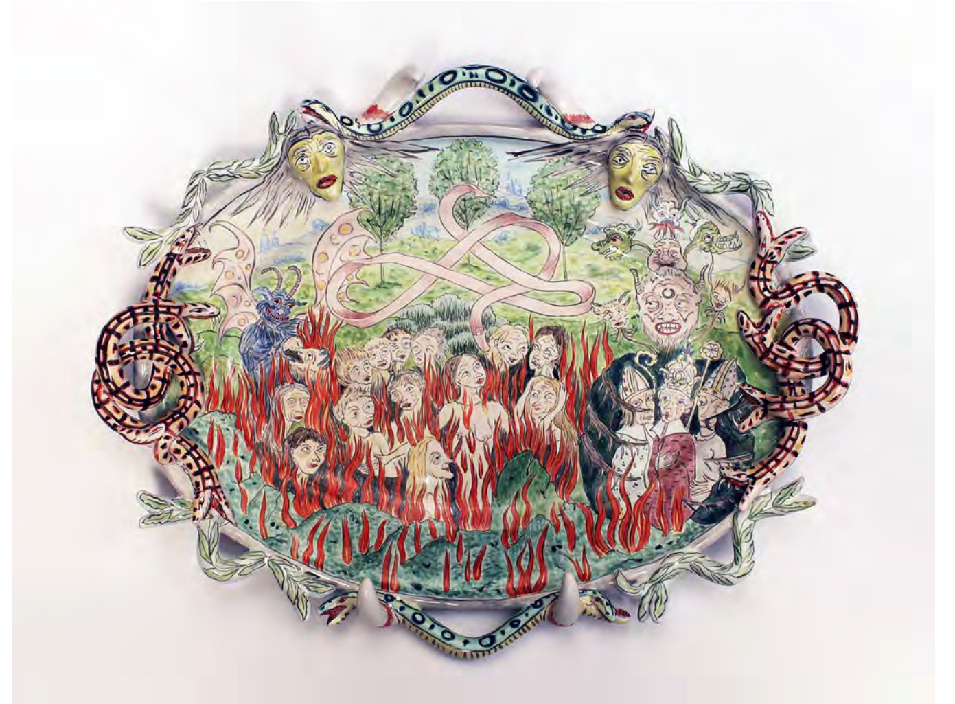
Lindsay Montgomery, "Happiness is a Warm Womb", 2020, tin-glazed earthenware, 12 x 8 x 1 inches, (above with detail, opposite)