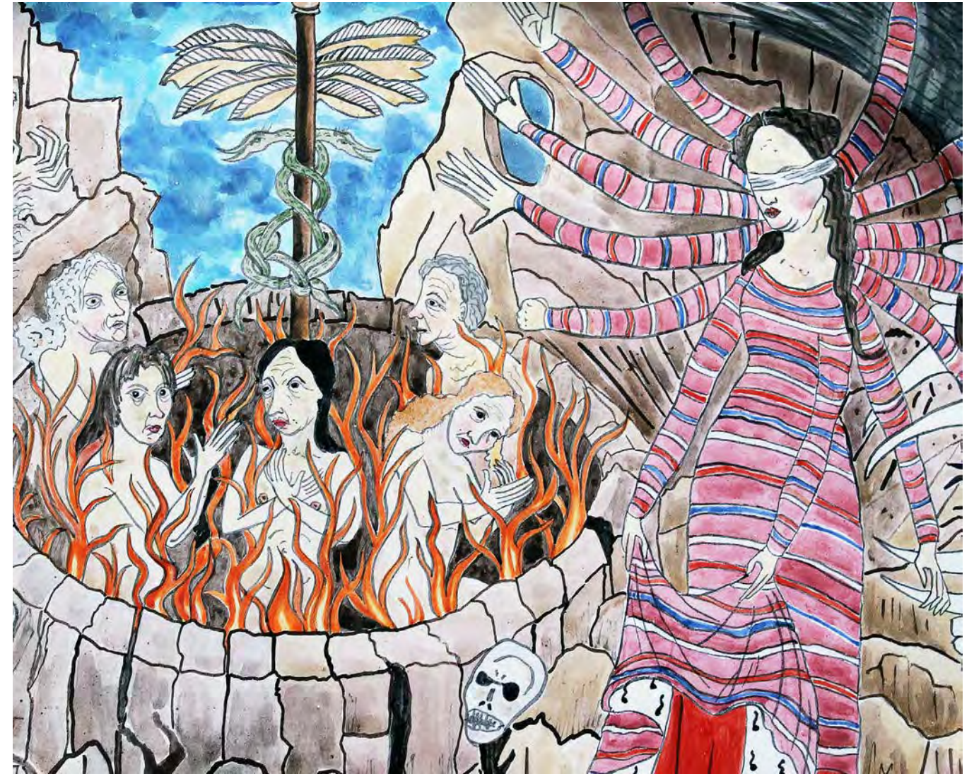
Lindsay Montgomery, "Hellmouth Charger", 2016, tin glazed earthenware, 15 inches x 29 inches (above, with detail opposite)