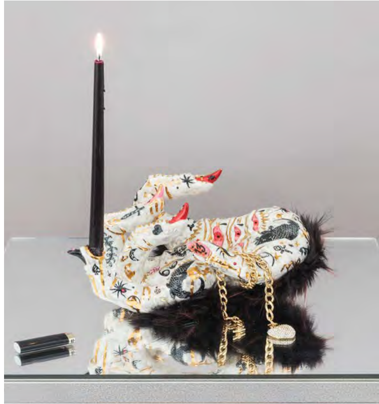
Roxanne Jackson, "Blackhearted", 2019, ceramic, glaze, luster, faux fur, candle, necklace, rhinestones, nail stickers; 15 x 17 x 9.5 inches

not only builds on pre-existing historical figures of female power, but subverts the gendered connotations of materials rendered in her paintings. For example, the patterning used on many of these hero images evokes craft, a medium traditionally dominated by women. In "Evil Eye Warrior", a woman knight stands victorious over three slain monsters' heads, her armour a patchwork of green swatches. In "Warrior with Severed Claw", a woman wears leggings made from many different types of cloth. In these works, quilting equals strength.