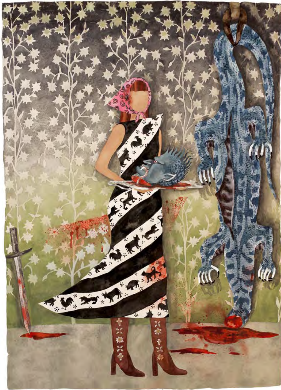
Keri Oldham, "Judith", 2016, watercolor on paper, 30 x 24 inches