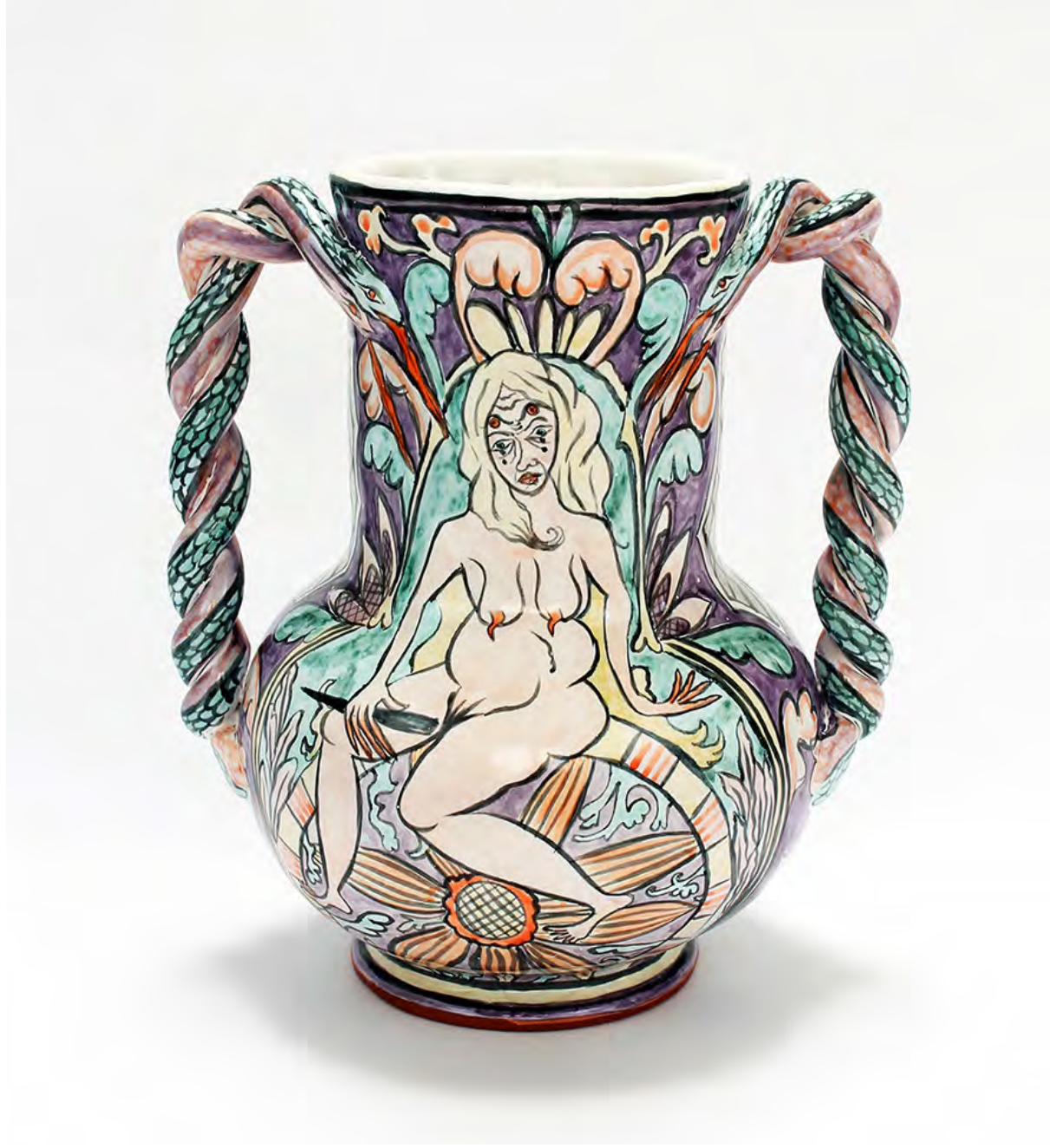
Lindsay Montgomery, "Slayer Albarello", 2020, tin-glazed earthenware, 12 x 9 x 5.4 inches (two views)