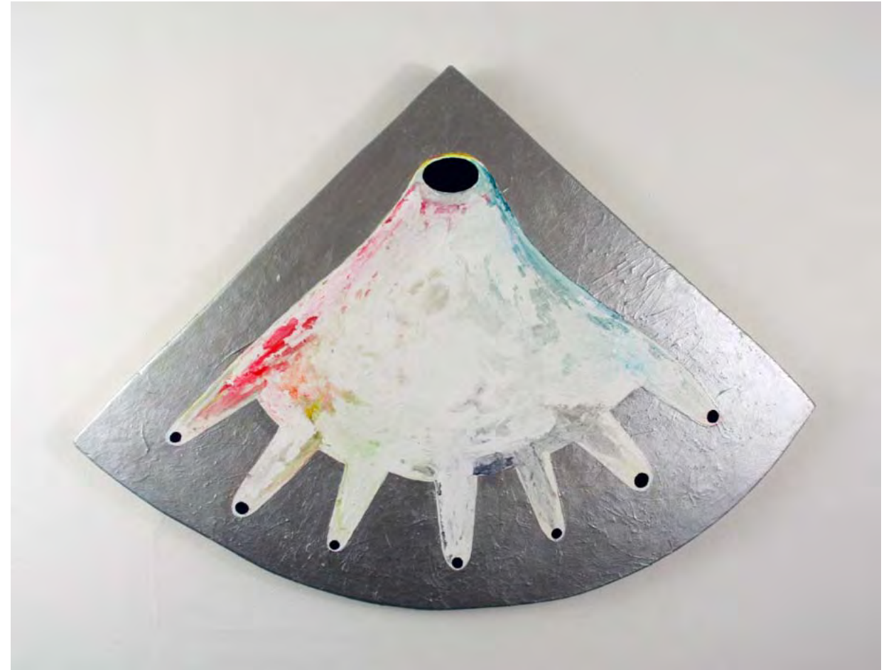
Vessel States , 22" x 30", acrylic on wood, 2012 (right)