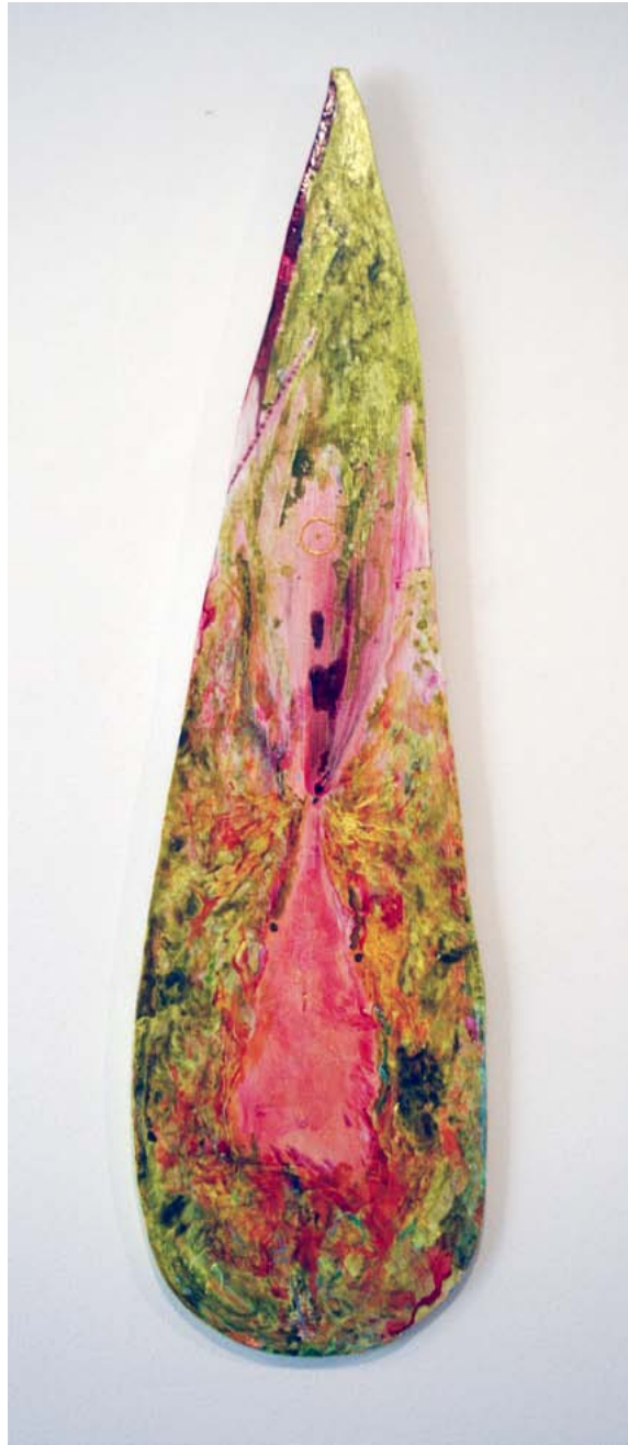
Secrets of the Bain-Marie , 35" x 10", acrylic on wood, 2012