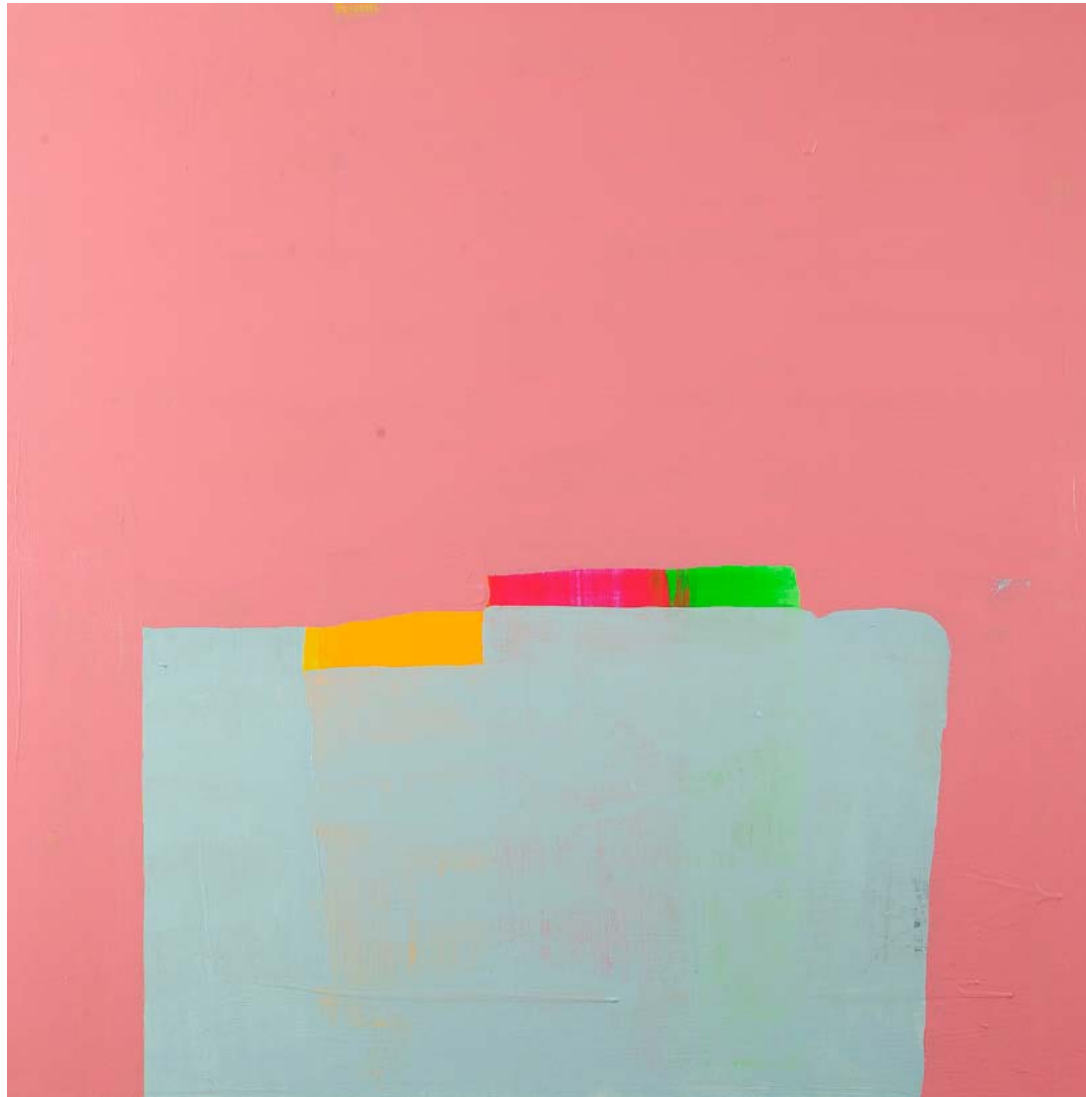
Steelville (1984), 50" x 48", acrylic on canvas, 2011 (above and on the cover)