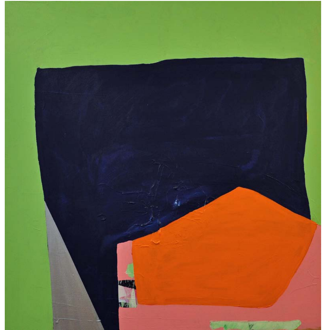
Behan on Ibiza, 52" x 50", acrylic on canvas, 2012