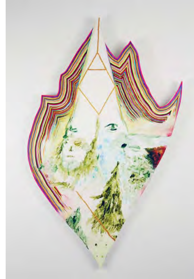
Craig Olson, Portrait of the Living Earth (I AM) , 36" x 13", acrylic on wood, 2012 (above)