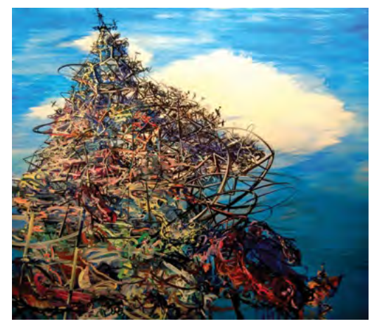
Deborah Brown, Slag, 2013, oil on canvas, 70 X 80 inches

the ubiquitous graffiti, the shoes adangle from telephone wires; hence the unshakable sense of the indirect aesthetic of all this. of its physio-emotional if not visual quietude. From her earlier landscapes to these post-industrial pastiches, of course, there are certain common features that Brown continued to treat with palpable awe and superb consistency: her radiantly chromatic, variably humored skies, those atmospheric canvases for cloudplay and expressive filterings of light. Indeed, Brown's arguable subject in her urban landscapes is most essentially, at least in this viewer's eyes, the sky. Herein, then, the plausibly Romantic statement of these works that might not readily scream with Romanticism: These matters of industrial detritus, these ruins and relics of our needs, wants, times and climes might not necessarily convey traditional beauties, yet the skies that beam, hum and burst above them are nonetheless no less—and perhaps all the more—sublime.