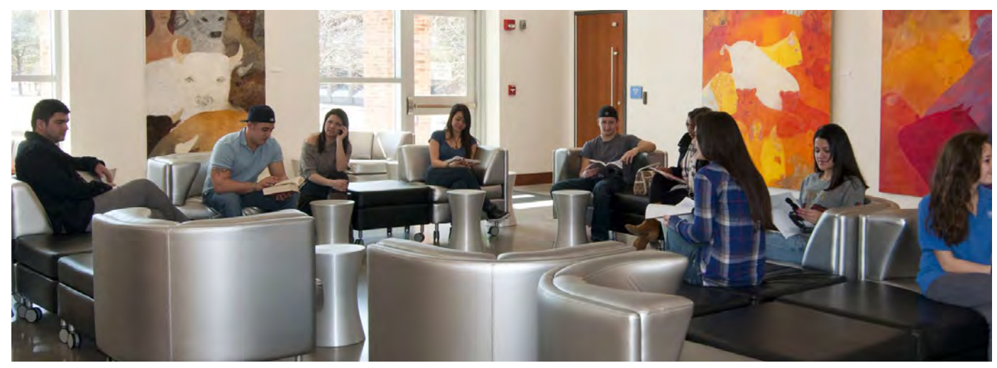
The Montaukett Learning Resource Center has student rooms available for reservation. There are group study tables on the second floor and there are larger meeting rooms which may be available for reservation through P122.